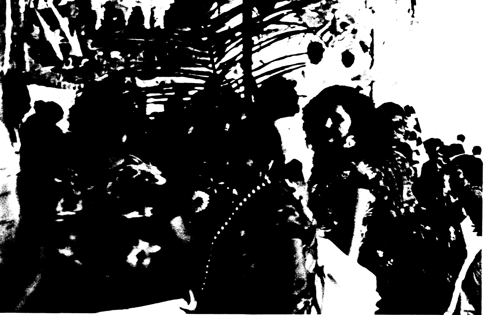
The village wedding

at the entrance to the party so you wouldn't have to carry it too far—a practical solution since men are expected to bring a carton of beer. Women offer the hostess a handkerchief wrapped around a token amount of money, the equivalent of about a dollar.