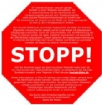
German advice on CP

First, the issue of terminology. I use the term 'child erotica' instead of 'child pornography' precisely because I want to reduce that inflammatory effect. The former is a neutral term, unlike the condemnatory 'pornography'. By child erotica I mean any depiction of children which involves their sexuality either suggestively or explicitly for the purpose of sexual arousal. The term can of course encompass written as well as visual erotica, but I am primarily concerned here with the latter, as the written form is nowhere near as controversial (except perhaps in Canada). I intend the word 'child' to be understood in a broad sense so as to include any person whose participation in erotica violates strong legal or social norms because of her young age.